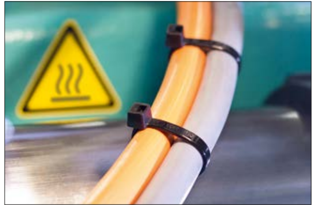
Heat stabilised T-Series cable ties up to +105 °C.