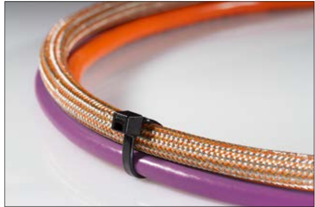
LK-Series – in-between size to T-Series.