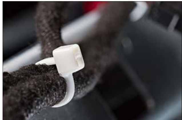
White T-Series cable ties for higher fire protection (PA66V0).