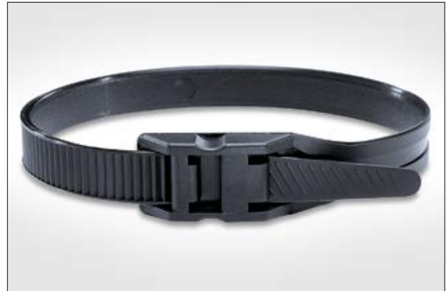
Low profile cable tie, LPH-Series.