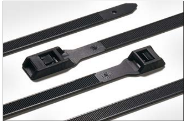
Low profile cable ties, RPE- and PE-Series.