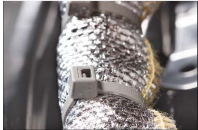
T-Series cable ties – higher temperature resistance up to +150 °C (PA46).