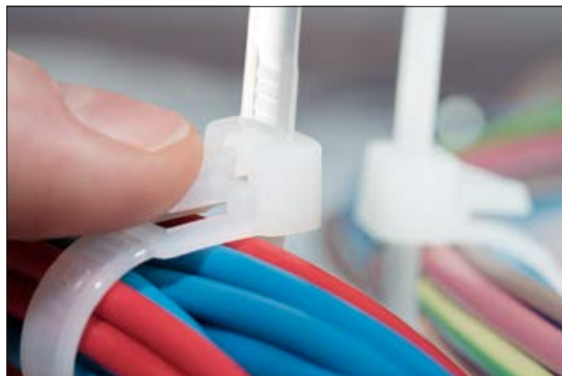
Releasable and reusable cable tie, REL-Series.