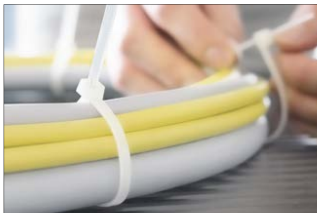
RELK releasable cable ties for temporary bundling.