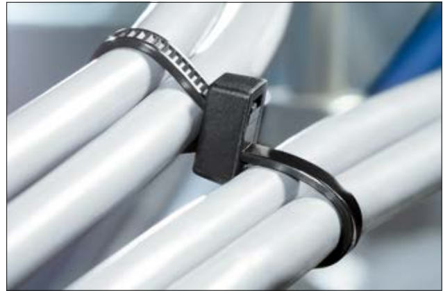
DH-Series cable ties for parallel routing.