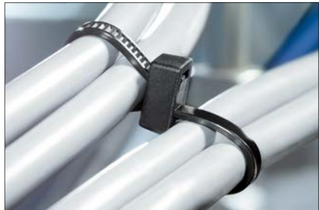
DH-Series cable ties for parallel routing.