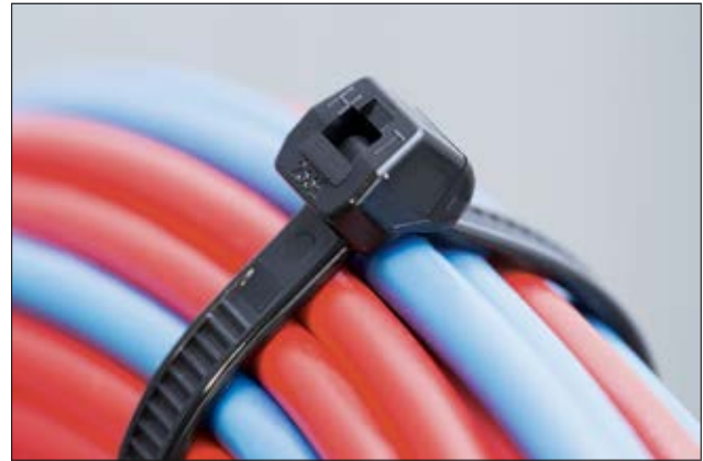
Outside serrated OS-Series cable tie with smooth surface to the bundle.