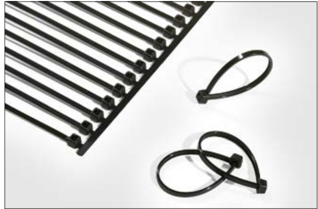
Cable ties for Autotool 2000 systems.