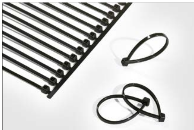
Cable ties for Autotool 2000 systems.