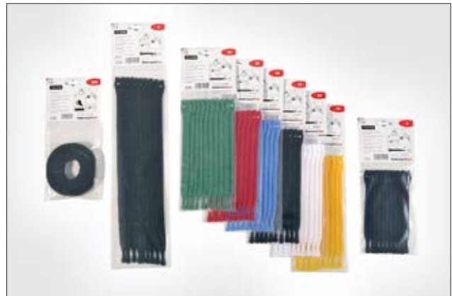
The TEXTIE-Series is available in different colours and lengths.