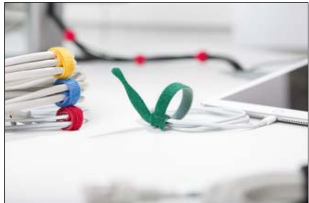
Due to the functional cable tie design the TEXTIE is fixed on the cable and cannot get lost.