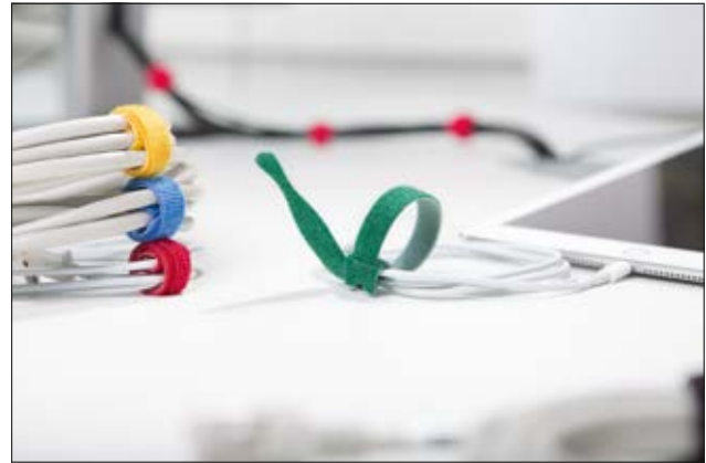
Due to the functional cable tie design the TEXTIE is fixed on the cable and cannot get lost.