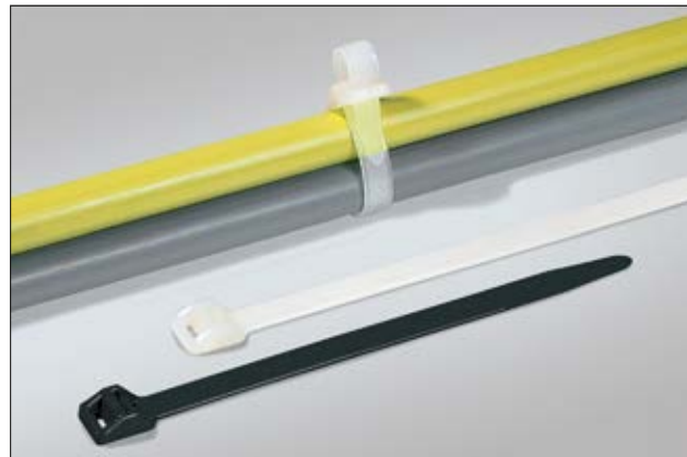
Ideal for larger or heavier bundles these ties can be opened and reused.