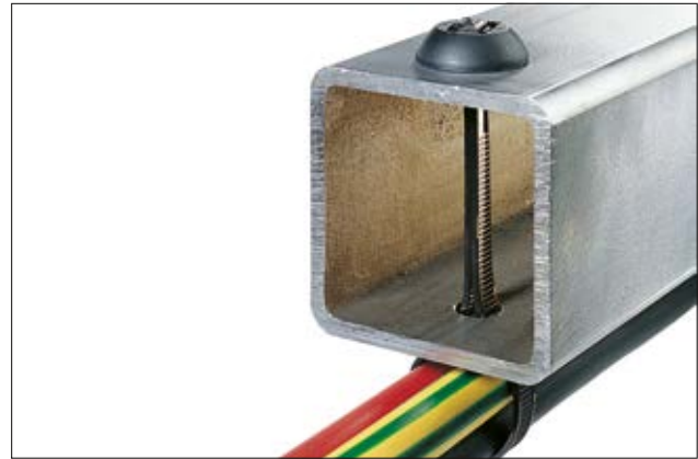
BHT375 - used for mounting cables via a single hole.