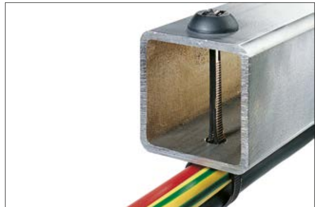
BHT375 - used for mounting cables via a single hole.