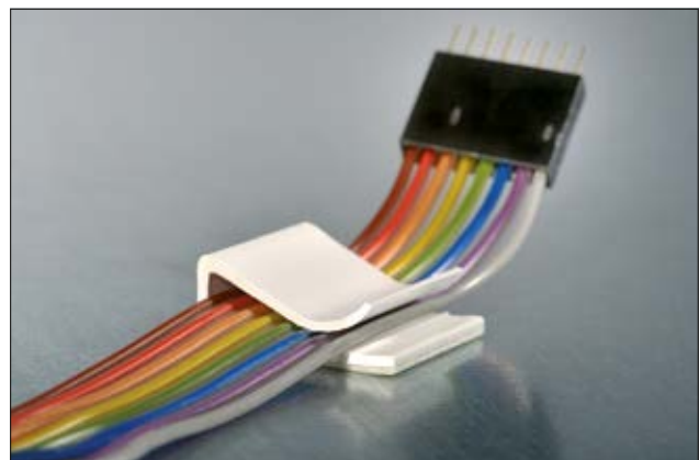
130100 self adhesive mount for flat cables.