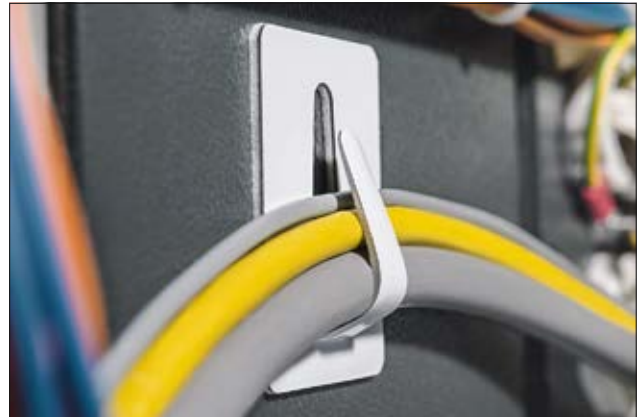
Malleable tongue allows for a variety of sizes per clip.