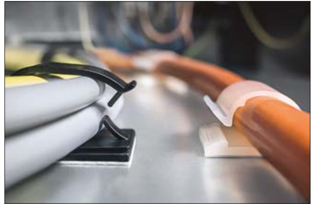
Self adhesive one piece fixing mounts RB20 (l) and RB14 (r).