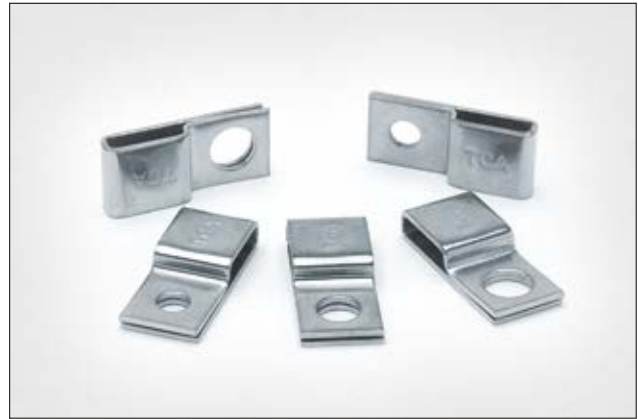
Stainless Steel P-Mount SSPC for use in arduous environments.

i The SSPC-Mounts can ideally be combined with the MBT cable ties on page 86–92 and with the MST and MLT cable ties on page 93, 94.