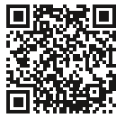
One Step to the Web!