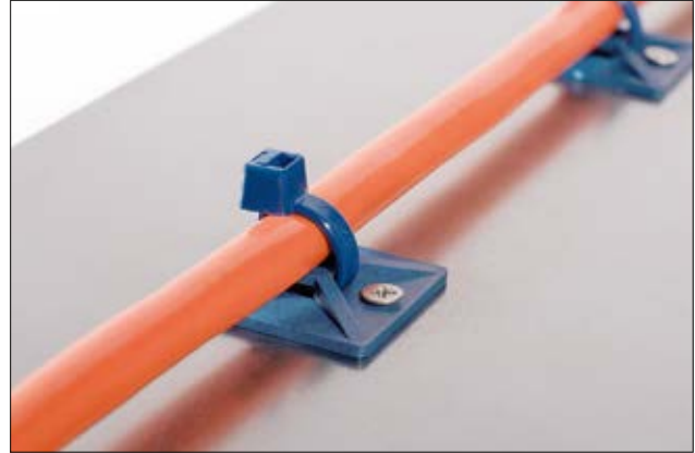
Detectable fixing solution containing of MCMB mount and MCT cable tie.