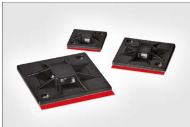
Mounting bases Q-Mount.