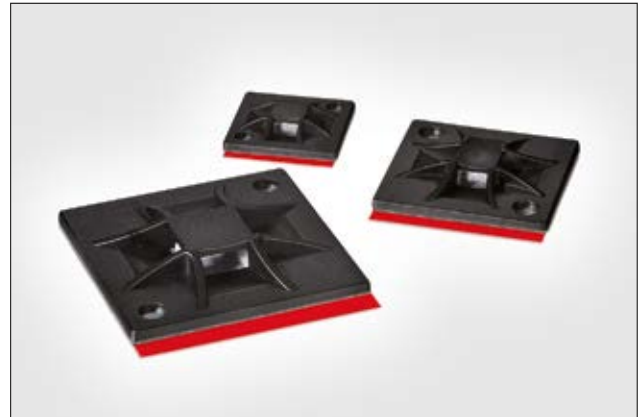
Mounting bases Q-Mount.