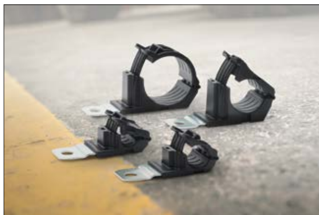
Ratchet P-Clamps in multiple configurations to handle a wide range of diameters and applications.