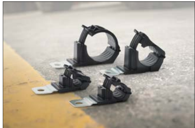
Ratchet P-Clamps in multiple configurations to handle a wide range of diameters and applications.