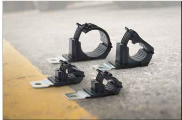
Ratchet P-Clamps in multiple configurations to handle a wide range of diameters and applications.