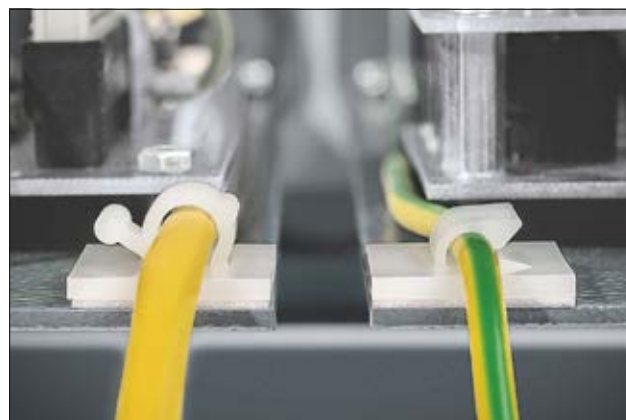
Self adhesive one piece fixing mounts RA6 (l) and RB5 (r).