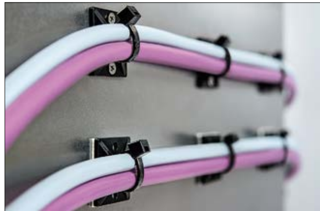
MB-Series Mounts with square design / screwable, self adhesive.