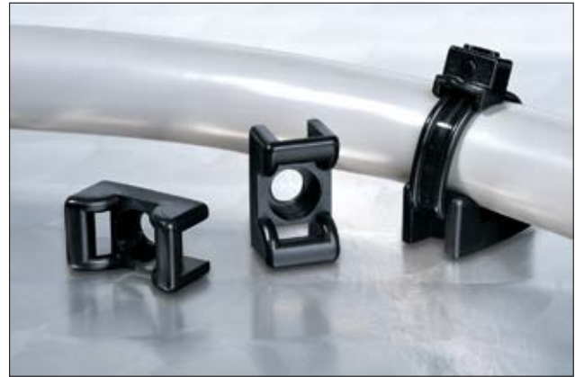
Cable Tie Mounts KR6G5, KR8G5 and CTM.