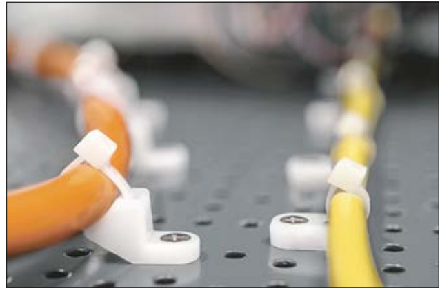
LKM, CL8 and FH cable tie mounts for applications with limited space.