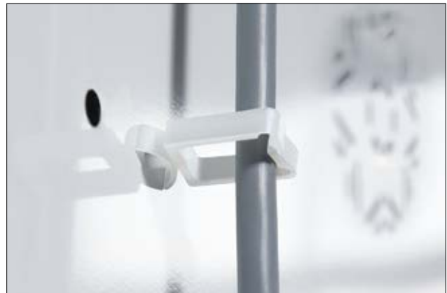
WPC – Wire Push In Clip.