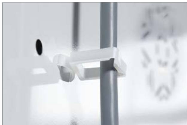
WPC – Wire Push In Clip.