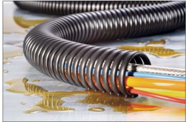
Spiral binding SPS is very robust and provides good protection against oil.