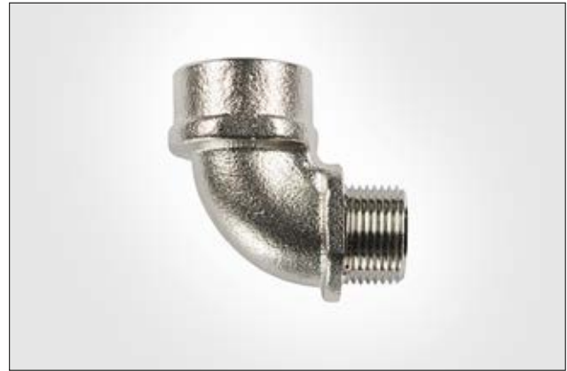
Helaguard A90FM 90° Elbow.