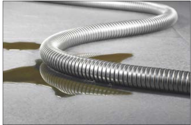
The HelaGuard SSC stainless steel conduit offers superior mechanical protection in corrosive environments.