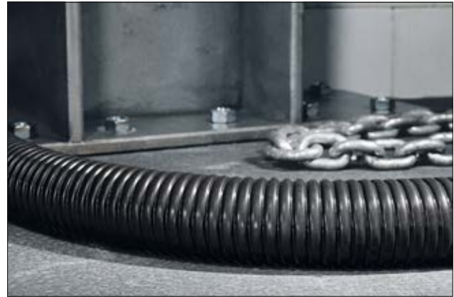
HelaGuard PCS Galvanised Steel Conduit with PVC Coating.