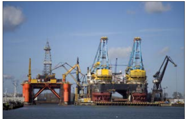
HelaGuard LTSH galvanised steel conduit with a smooth, liquid-tight thermoplastic rubber cover offers very good resistance to oils, greases, petrol, acids and UV.