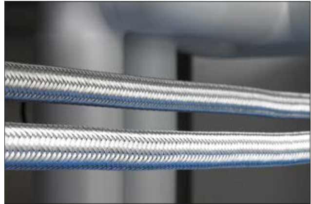
The HeloGuard PCSB galvanised steel conduit with a PVC coating galvanised steel overbraid offers high abrasion resistance and EMC screening.

Stainless steel and tinned copper braiding is also available.