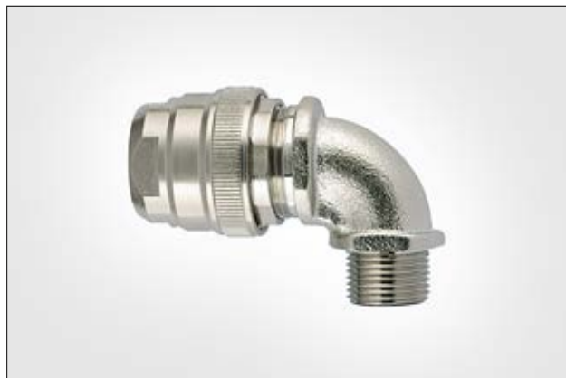
HeliaGuard PCSB-90FMC Swivel Compression Fitting.