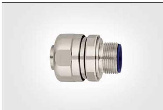
HelaGuard PSRSC-FMCFSS stainless steel fittings for applications in the food-processing industry.