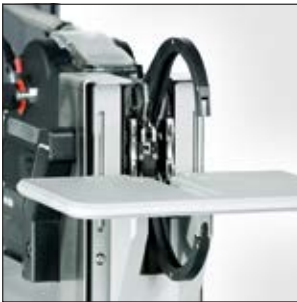
Optional: Bench mount kit 3080 with table board.