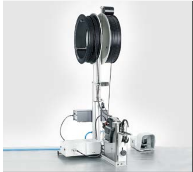
Bench mount kit 3080 with foot pedal (also shown: Autotool System 3080, Power pack 3080 and consumables).