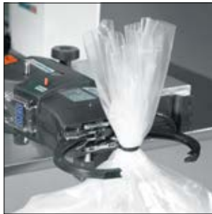
Packaging application with Bench mount kit horizontal 3080.