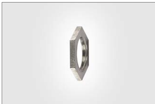
HelaGuard ALNPB Nickel Plated Brass Locknuts.

The ALNPB hexagonal locknut is used to secure fitting.