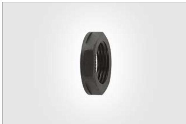
HelaGuard ALPA PA66 Locknuts.

The ALPA hexagonal locknut is used to secure fitting.