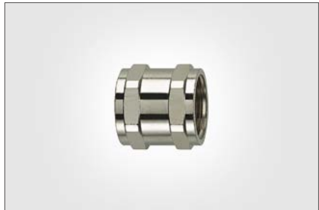
HelaGuard ACP Couplers.