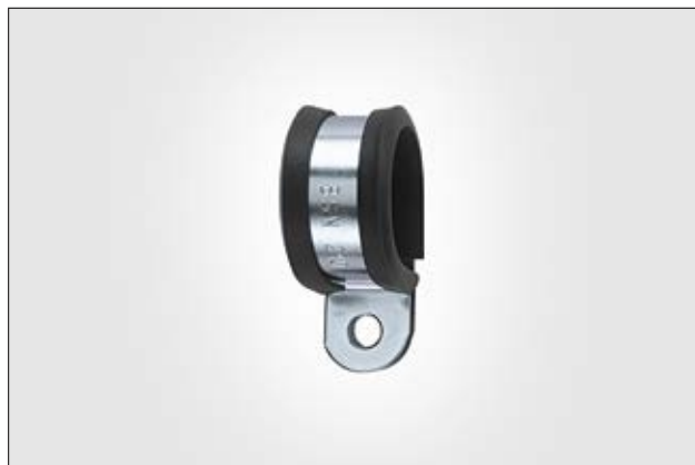
HelaGuard AFCS Fixing Clip, Stainless Steel and PVC Liner.