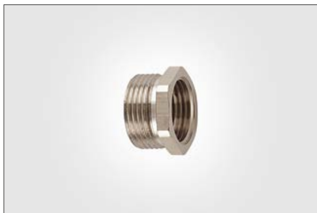
HelaGuard CNV Thread converters.