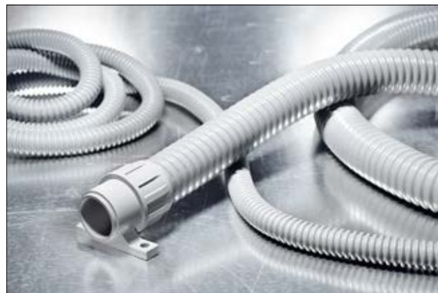
FlexiGuard FG with FG-UH fitting.