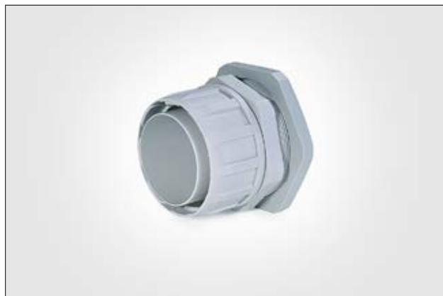
FG conduit fitting.