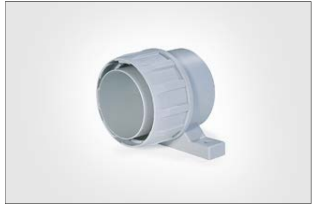
FG-UH fitting with bracket.